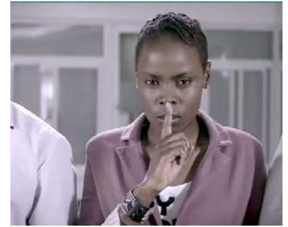
Still from a Safaricom video to its employees

The successful prevention of violence in the 2013 elections suggests that these activities were valuable, and that the kind of systemic engagement that the various business bodies and companies, civil society, and government did in the lead-up to the 2013 elections can be valuable.