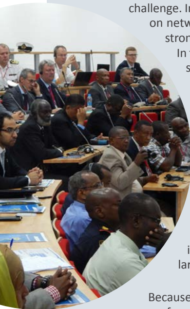
Regional training centre under Djibouti Code of Conduct opens.

Because network systems frequently have little central authority to enforce decisions, it is easy for participating institutions to fail to follow through on their commitments, even when they are made with the best intentions. This issue can be addressed through the use of "backbone support institutions." 36 These act as information centralizers for the network, tracking activities of members and documenting commitments made and their follow-through. 37 It can also be addressed by passing the decisions made by network systems into more formal and hierarchical