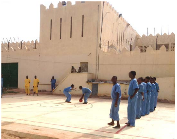
Many convicted pirates were sent to Hargeisa Prison.

Many of the formal responses to Somali piracy began in 2008 following UN Security Council resolution 1816, which allowed states cooperating with the Transitional Federal Government of Somalia to enter Somali territorial waters and use “all necessary means” to repress acts of piracy and armed robbery at sea in a manner consistent with international law for a period of six months. 5 The three “pillars” of counterpiracy activities soon emerged: naval operations, industry self-protection, and rule of law. On the naval side, NATO deployed naval vessels under Operation Allied Provider in October of 2008. The EU deployed naval vessels under Operation Atalanta in 2008 as well, as did Indian, Russian, and Chinese navies. On the industry side, the initial “Best Management Practices to Deter Piracy in the Gulf of Aden and off the Coast of Somalia” were released in February of 2009 by a group of industry associations. 6 Operations under the rule of law pillar began as early as 2009, but took somewhat longer to demonstrate impact. The effectiveness of the coordinated response to judicial capacity-building in the region was clear by 2011 when the communique from the 8 th Contact Group on Piracy off the Coast of Somalia meeting documented 850 7 prisoners being