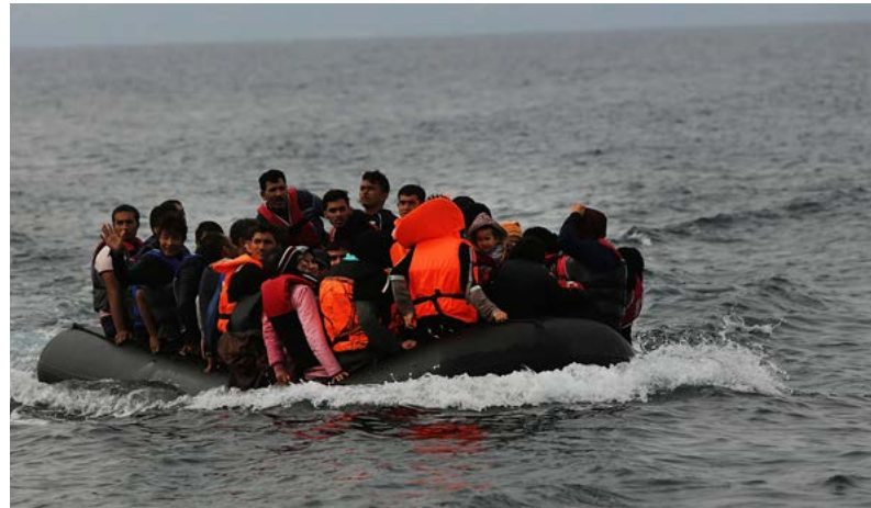
A raft en route to Greek island, Lesbos.

While irregular migration at sea is a completely different problem from maritime piracy, many of the same actors are impacted by both. It became increasingly clear in 2015 that many of the lessons learned from bringing stakeholders from different sectors together offered practical tools useful for the international efforts to address unsafe mixed migration at sea in the Mediterranean. As an example, the IMO hosted a High-Level Meeting to Address Unsafe Mixed Migration by Sea in March 2015 for government and shipping industry organizations. In his closing remarks, the IMO Secretary-General used the success of the CGPCS as an example of the need to have a place to maintain international attention and efforts to tackle the continued migration crisis in the Mediterranean, and suggested that the IMO could perform such a convening and coordination function. 67 Since then, the IMO has addressed mixed migration at sea in its Maritime Safety Committee as well as through exhibitions and participation in conferences on the topic. 68