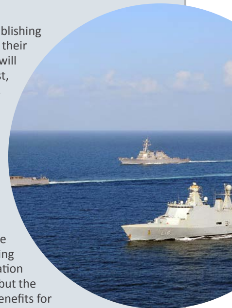
Naval vessels transit Gulf of Aden.