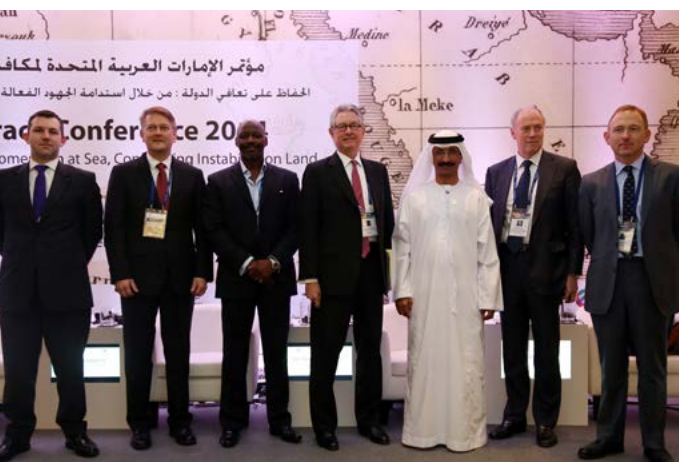
UAE Counter-Piracy Conference 2014

Within each of these three pillars, initial activities took place through coordination within each relevant sector. Mechanisms such as the Shared Awareness and Deconfliction (SHADE) initiative, which established a series of meetings for deconflicting naval operations, came into being at roughly the same time as independent naval operations were deployed. 9 However, it wasn't until the Contact Group on Piracy off the Coast of Somalia (CGPCS) was established as a formal multi-sector coordinating tool in early 2009 that there was a unified platform for coordination and strategy across the multiple different sectors. 10 While the individual pillars did what they could to address piracy within their own areas of responsibility, there was not a significant decline in Somali piracy until well after the CGPCS and associated mechanisms began to operate in a mature and inter-coordinated way. While establishing causality is difficult, there is a strong argument to be made that no sector had the capacity to eliminate piracy on its own; it required the coordinated activity of the different sectors working together. 11