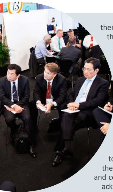
Danish Maritime Days conference, 2014.

them in some capacity. 30 This allowed these systems to tap into a much wider set of capacities than they could have if these actors had not been included. Because network institutions' impact comes from their participants rather than their institutional activities, the breadth and depth of the network becomes an important driver of the overall impact. Institutions which focus on too narrow a set of potential stakeholders run the risk of maximizing coordination among that limited set of actors but not addressing the whole of the problem.