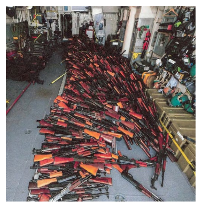
Weapons seized from smugglers on an Iranian dhow near Yemen's coast.

While these examples garner international attention, illegal fishing is not sufficiently prioritized. In many countries, violating fishing laws is not even considered a criminal offense. As a result, enforcement of fisheries regulations is not allocated the vital resources needed for sufficient deterrence.