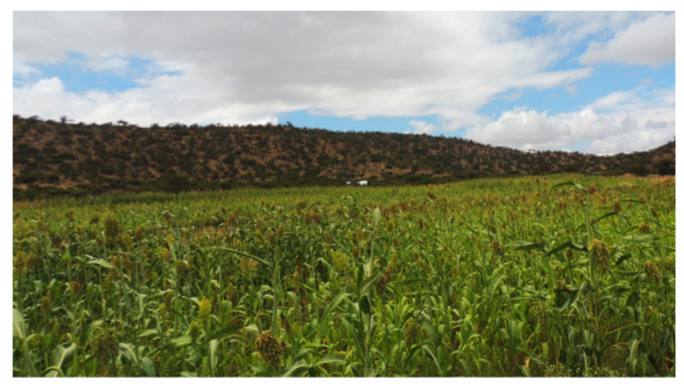
Sorghum Growing In Somaliland

Generally, Somaliland has gone the furthest in creating a new formal legal framework for land and in developing hybrid institutions that blend aspects of customary and formal tenure. These advancements have been well-documented, particularly compared with Puntland and South-Central Somalia where insecurity has impeded the work of outside observers. The section of this paper devoted to Somaliland is comparatively longer in order to cover this literature and to provide examples of approaches that may be transferable to other parts of Somalia once the security situation improves.