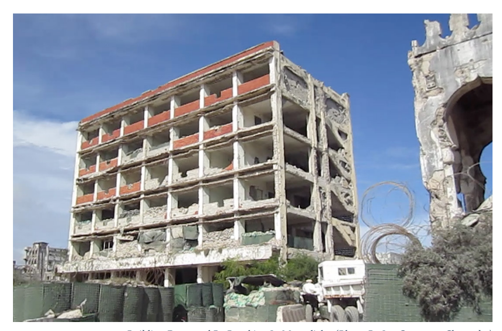
Building Damaged By Bombing In Mogadishu

Somalia's descent into civil war and failed state status was the result of many factors. After a failed invasion of Ethiopia and loss of international support, internal opposition to Barre's rule grew. This opposition was met with growing repression including air raids in Somaliland which left thousands dead and forced many thousands more to flee.<sup>23</sup> After rebel groups gained control in the north, the violence shifted to the south where the Barre regime's favoritism for certain client clans had already had a destabilizing effect. Under increasing pressure, Barre fled the country in 1991, leading to the collapse of the central government. The vacuum was filled by warlords who began fighting for control of different areas of the country.