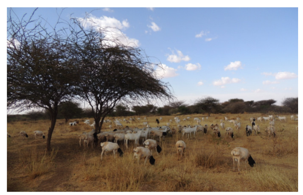
Goats Grazing In Somaliland

responsible for the actions of individual members and are required to pay diva, or blood money, in the case of intra-clan crimes such as theft or murder.