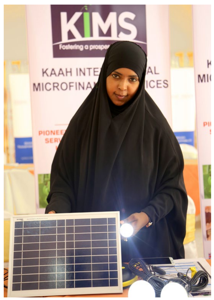
A KIMS employee at the SIF Hargeisa trade show

Work in Progress! is a program offering tailored business development services (BDS) to ten selected small and medium sized enterprises (SME) with a strong potential for employing women and youth in Somaliland. The program strengthens the capacity of participating businesses by providing tailored BDS ranging from fundamental business principals, concepts and services, to individual