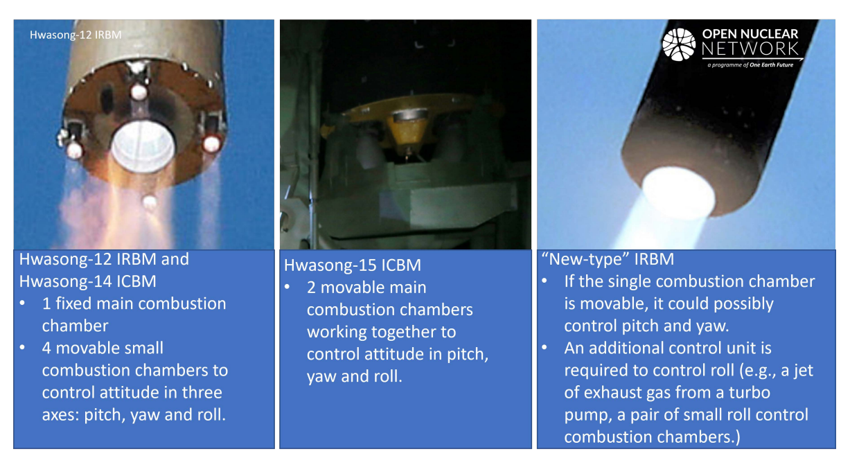
Figure 1. Comparison of the propulsion units between existing Hwasong strategic missiles and the "new-type" IRBM. Images: sogwang media corporation, KCNA, KCNA/Reuters[2]

4 October, which reportedly flew ~4,500 The DPRK launched IRBM an on km with an apogee of ~1.000 km. This is the fifth confirmed IRBM launch, the second this year, and the third to overfly Japan. The DPRK claimed used instead of the Hwasong-12 IRBM, it a "new-type ground-toground intermediate-range ballistic missile" for this launch. Based on available images, it is difficult to determine what mechanism was applied for the attitude control of the missile (Figure 1). The bottom of this "new-type" IRBM looks too rounded and smooth for a liquid propellant ballistic missile of this type (Figure 1), indicating that image manipulation may have been involved.[1]