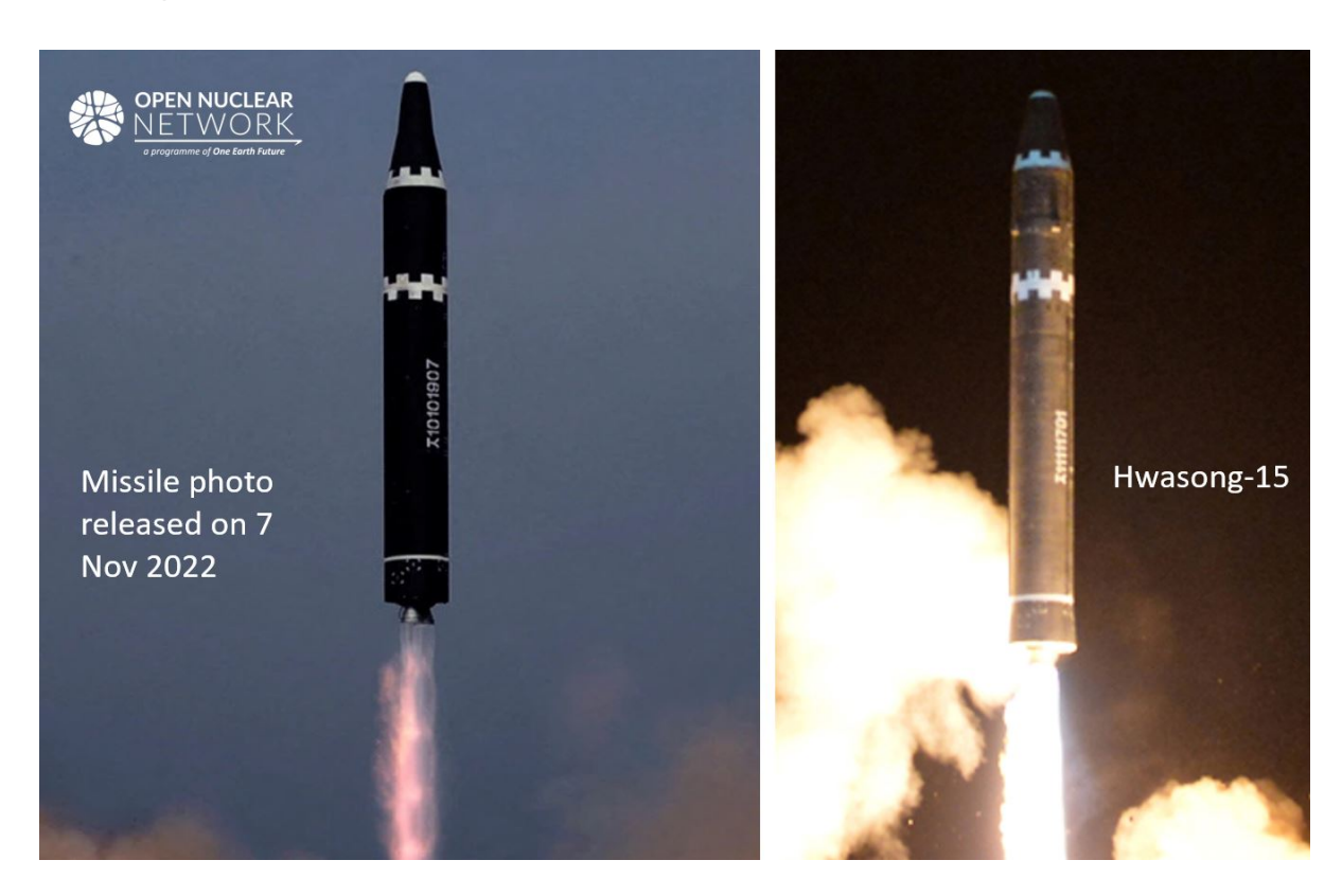
Figure 4. Comparison between the ballistic missile photo released on 7 November and the photo of Hwasong-15 ICBM launched in 2017 (right).

The DPRK described its allegedly failed ICBM launch on 3 November as "a ballistic missile to paralyze enemy operation command systems". According to the image released by the DPRK on 9 November, the missile appears to be a shortened and modified Hwasong-15 ICBM (Figure 4); however, there is not sufficient evidence at this time to make any confident conclusions. The ROK previously assessed the 3 November ICBM to be a Hwasong-17 and has not updated its assessment since then.