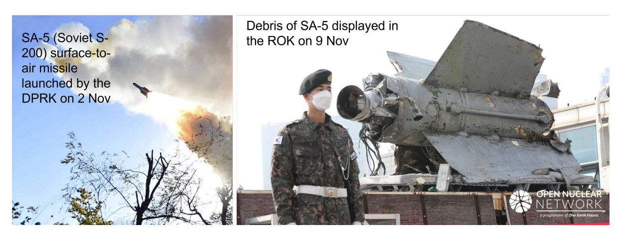
Figure 5. The ROK has salvaged debris of at least one SA-5 SAM from the sea.[8]