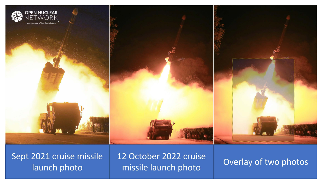
Figure 2. Comparison between cruise missile launch photos released by the DPRK in Sep 2021 and Oct 2022.

The photo album published by the DPRK covering its 2 to 5 November launch campaign[4] contains a photo of a small ballistic missile that was first publicly revealed in April 2022.[5] However, a comparison of the launch photos indicates that the DPRK re-used an old photo from April 2022 in its report covering its 2 to 5 November launch campaign (Figure 3), reducing the credibility of the DPRK's announcement.