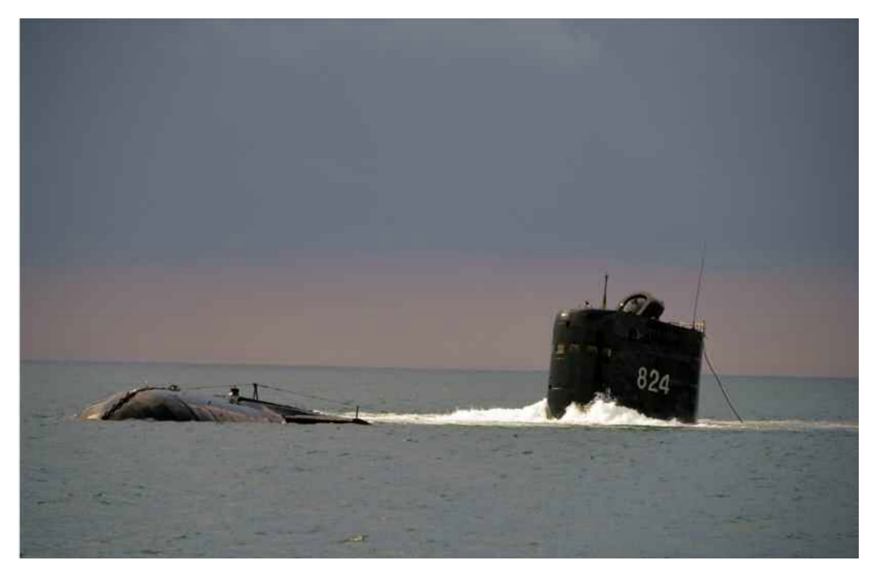
Figure 4. Photo of the "8.24 Yongung" released on 20 October 2021. The cover of the SLBM launch tube, which is located in the sail of the submarine, is open. It appears that there is only one launch tube inside the sail.

KCNA reported that the new SLBM was launched from the "8.24 Yongung" [8.24 영웅함] (Figure 4).<sup>4</sup> This is the first time the DPRK has revealed the official name of the country's experimental ballistic missile submarine, which is often referred to by external observers as "Sinpo-B class," "Gorae class" or "Sinpo class".<sup>5</sup> Although KCNA reported that the submarine had also carried out the country's first SLBM test five years ago, on 24 August 2016, the Republic of Korea (ROK) has assessed that the SLBM tests carried out in the past were conducted from a testing barge, rather than from a submarine.<sup>6</sup>