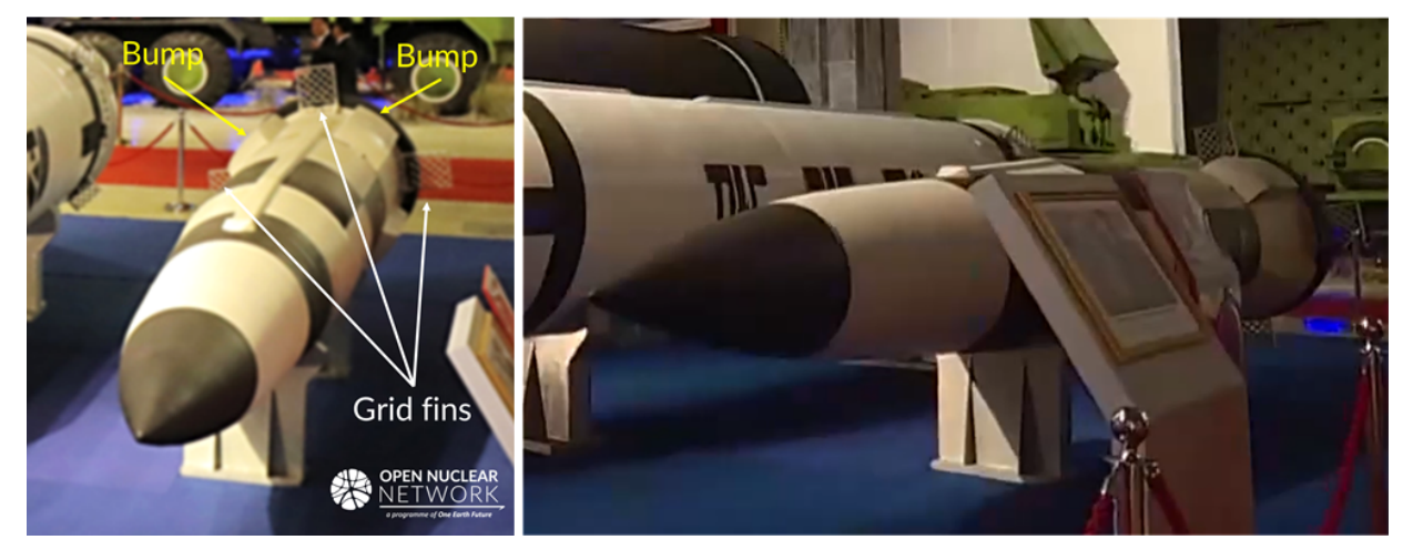
Figure 1. The small SLBM that made its public debut at the exhibition on 12 October (left and right). The grid fins installed between the bumps are meant to increase the stability and possibly control the attitude of the missile during the ejection process.

The SLBM launched on 19 October appears to be the same type as that showcased at the Defence Development Exhibition "Self-Defence-2021" held on 12 October 2021.<sup>1</sup> The missile is powered by a single stage solid rocket motor and has four "bumps" around the tail section. Four grid fins, which are in a folded position before launch, are located between the four bumps (Figure 1).