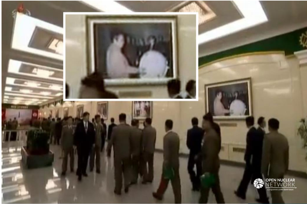
Fig. 2. Processed and enhanced image of a photo displayed at a meeting in celebration of the completion of the DPRK's nuclear arsenal. [9]

Furthermore, State media photos can also provide raw material for further analysis to obtain previously unknown information and insights, for example the use of mensuration techniques to obtain technical specifications of weapon systems whose potential and capabilities remain relatively unknown. Using images published by DPRK State media, ONN measured the dimensions of submarine-launched ballistic missiles showcased by the DPRK and analysed their potential. [10]