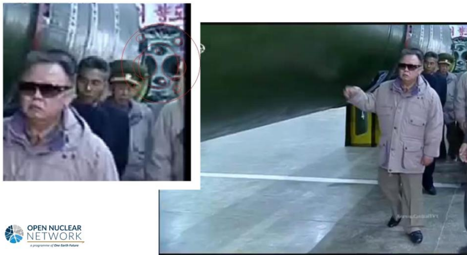
Fig. 1. Kim Jong Il inspects Hwasong-13 ICBM. Inset photo: a corner of the frame revealed the engine configuration of the missile's first stage. Red circles illustrate the contour of the bottom of the first stage. [7]

For example, in a 2015 documentary released by State-run Korean Central Television (KCTV), late DPRK leader Kim Jong Il is seen inspecting Hwasong-13 intercontinental ballistic missiles (ICBMs). Analysts spotted the first-stage engines of the missiles in a few fleeting frames in this documentary (Fig. 1.). This discovery offered the world's first concrete indication of these missiles' configuration.