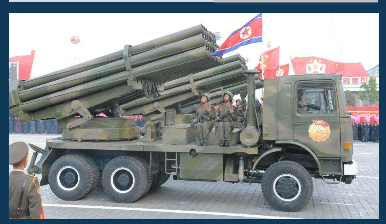
240 mm multiple rocket launcher in a parade on 10 October 2015