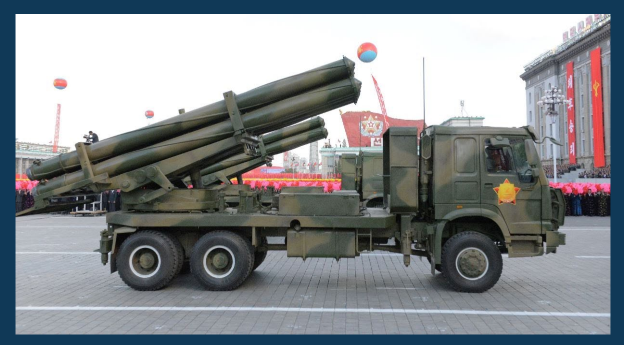
KN09 multiple rocket launcher shown in a parade on 10 October 2015