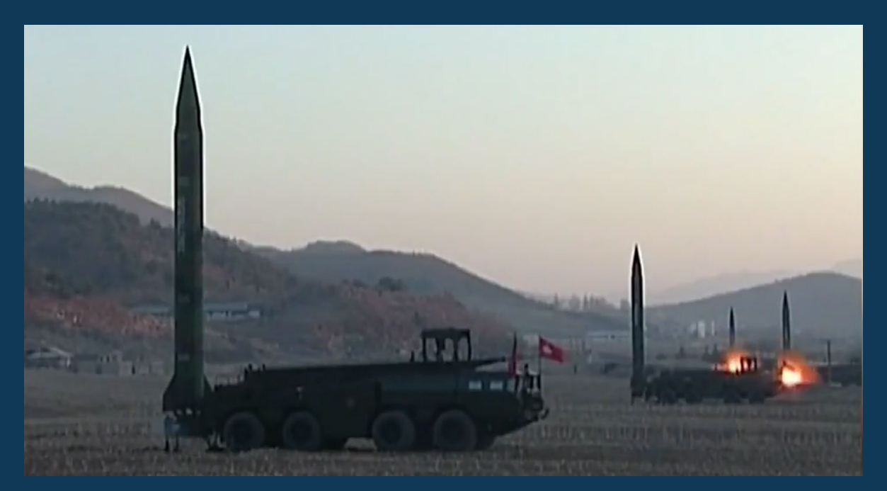
Four Scud-ERs on MAZ-543 launchers during an exercise, 6 March 2017