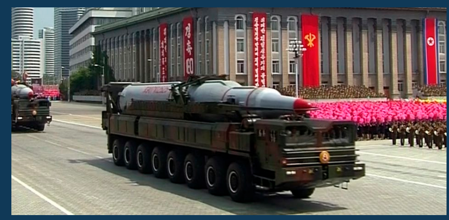
Hwasong-13 Mod 1 on a WS51200 truck shown at a parade on 15 April 2012. Mod 1 is a three-stage, liquid propellant design.