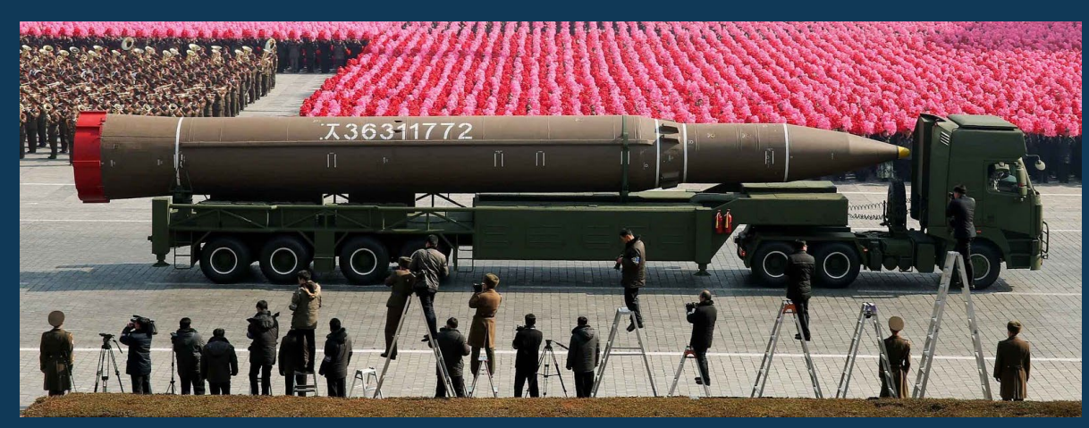
Hwasong-14 on display in a parade on 15 April 2017 This is only a display trailer, not a launching vehicle.