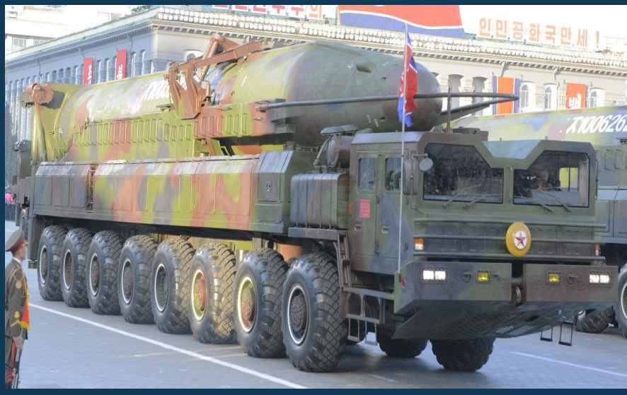
Hwasong-13 Mod 2 on a WS51200 truck in a parade on 10 October 2015. Mod 2 is a two-stage design.

The two configurations of the Hwasong-13 ICBM heavily relied on engine technologies of the Hwasong-10. They are likely to have been abandoned in favor of the Hwasong-14 and Hwasong-15.