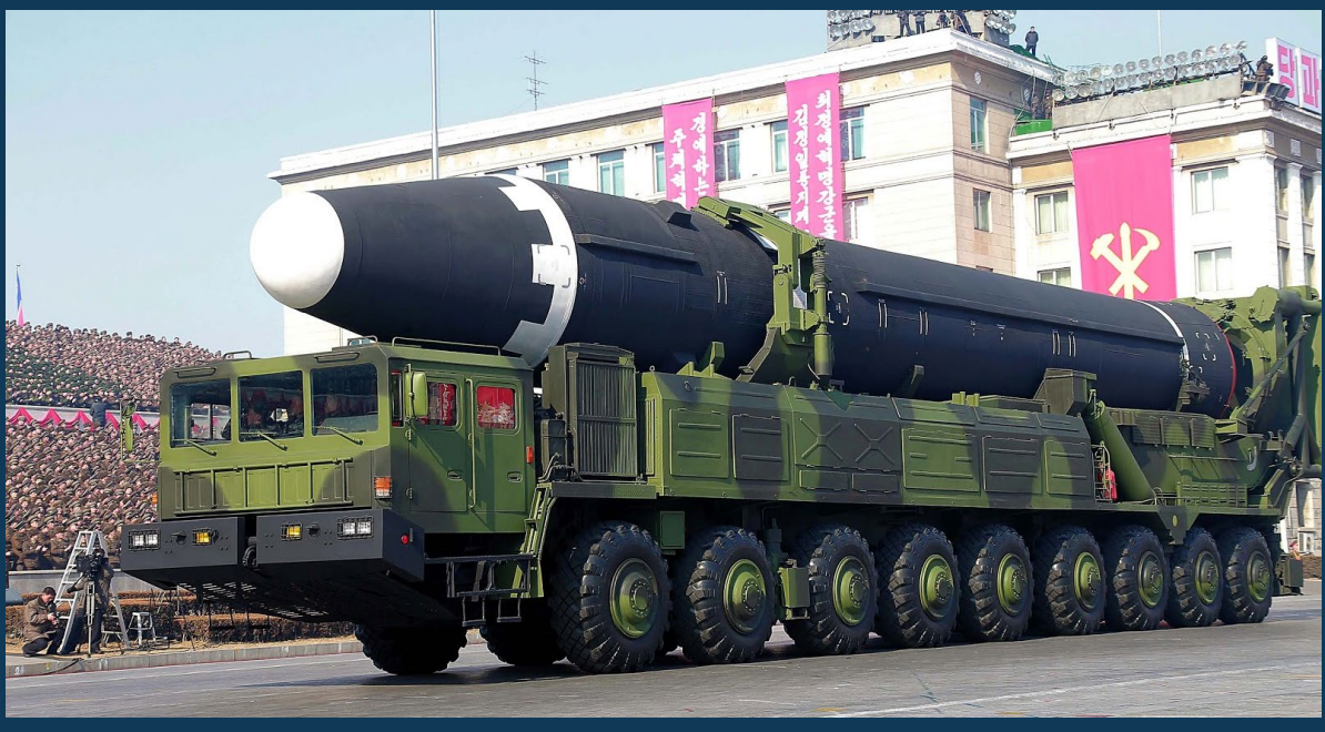
Hwasong-15 shown on a 9-axis modification of the WS51200 on 8 February 2018