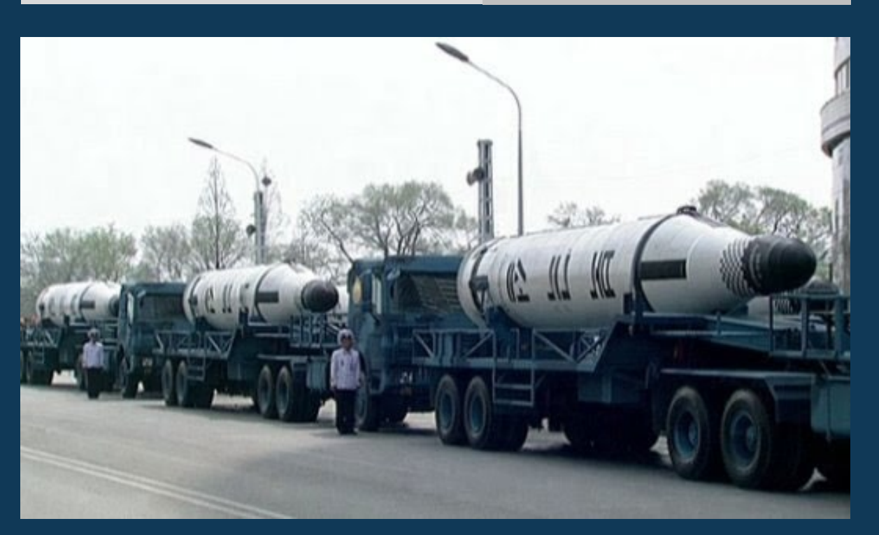
Pukguksong-1 on a display truck shown at a parade on 15 April 2017