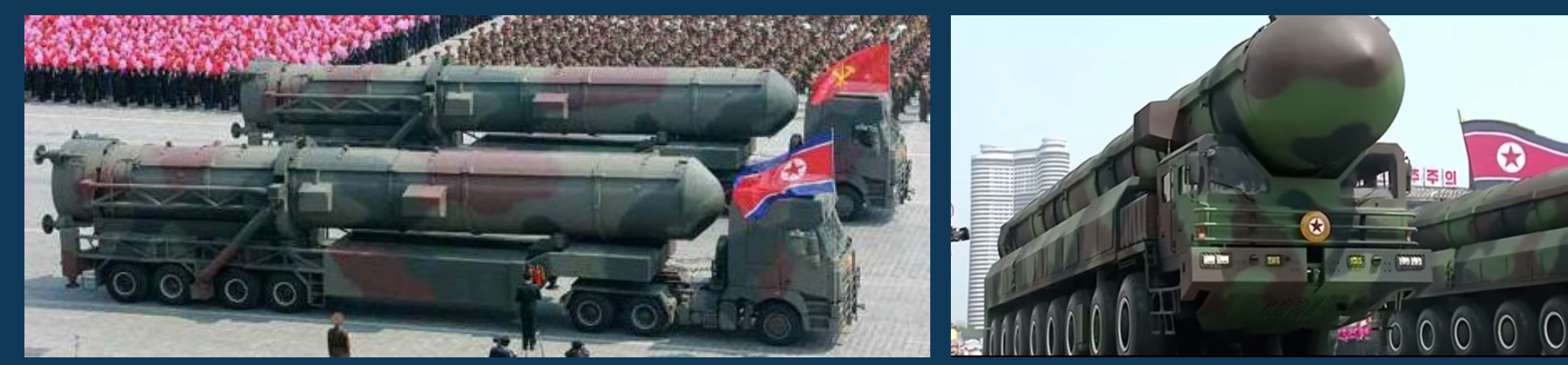
Missile model 1 shown at a parade on 15 April 2017. The same trailer was also used to showcase the Hwasong-14