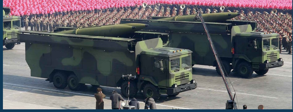
KN23 at a parade on 8 February 2018