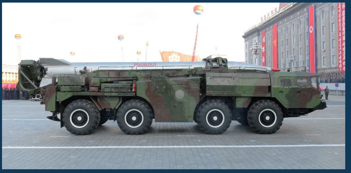
Hwasong-6 at a parade on 10 October 2015