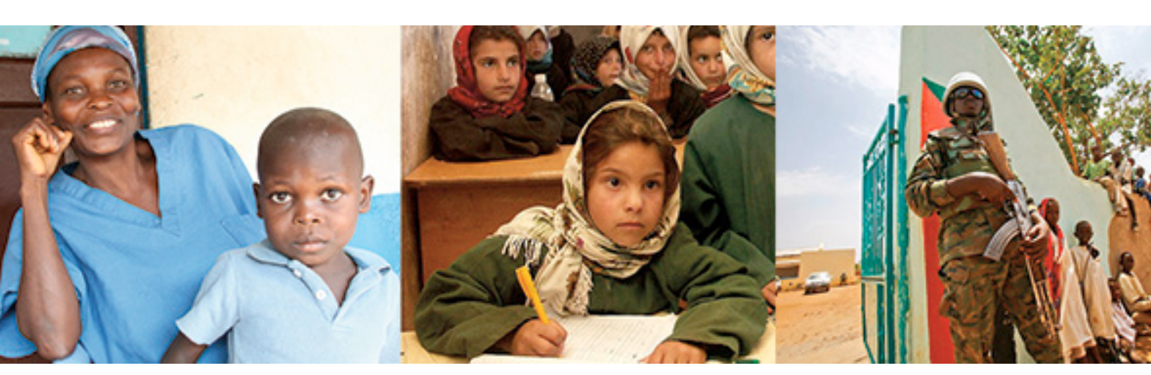
Governance systems that provide social services such as education, health care, and security have been linked to increased peace.