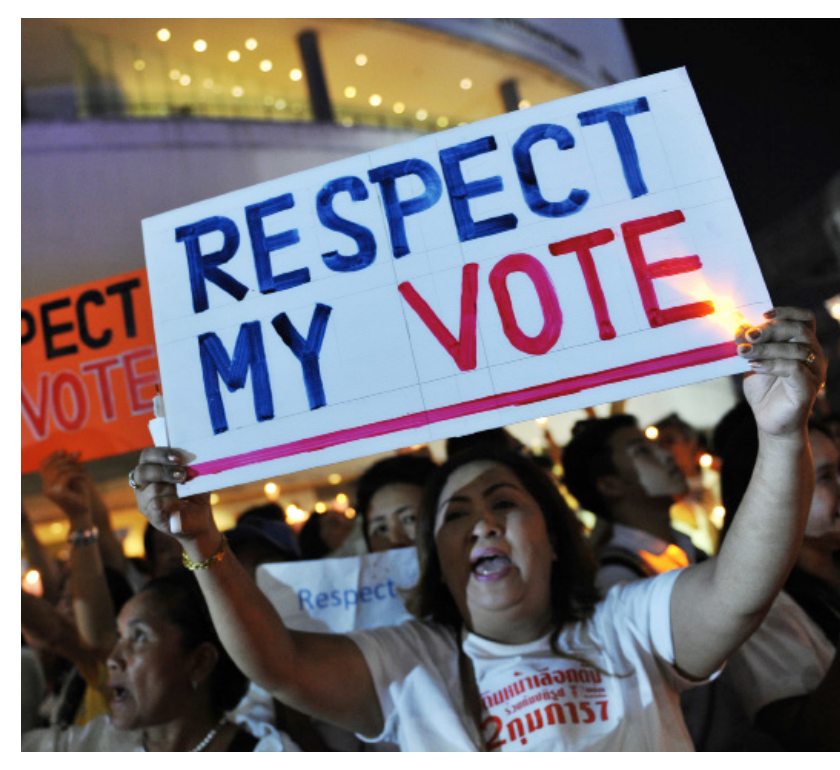
Protestors\ in\ Bangkok,\ Thail and.\ Photo\ by\ Rufus\ Cox/Getty\ Images

Addressing these challenges in fragile and conflict-affected countries will probably require multidimensional approaches to to that work simultaneously to promote different aspects of governance. International organizations working on development or stability have realized this, with organizations from the World Bank to the Catholic Relief Services developing multifaceted interventions in the areas where they work. Promoting this kind of intervention will likely require coordinated action among multiple actors working in the same contexts but focusing on overlapping issues.