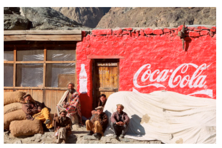
A Coca-Cola sign in Pakistan.

India and Pakistan were ruled as a united territory under British colonial rule, but ethnic tensions between the Hindu, Sikh, and Muslim communities led to a 1947 plan to partition the country into Hinduand Muslim-majority countries. The announcement of the planned partition immediately heightened existing ethnic tensions, leading to widespread communal violence and large numbers of displaced people. Both communal violence and cross-border