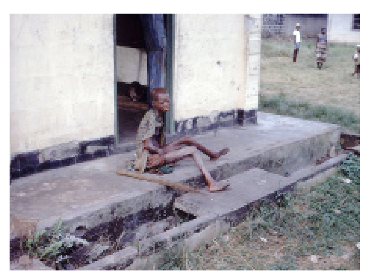
Nigerian refugee in Nigeria-Biafra war zone.

Early elections resulted in political dominance by the Nigerian north, and also featured ethnic mobilization and interethnic violence among some groups within Nigeria calling for more self-determination. Concerns about inequality and the perceived corruption of the government led to labor disputes and a nation-wide strike in the mid-1960s. This dissent culminated in a series of coups d'état and violent attacks in 1966, resulting eventually in the installation of the Igbo general of the Nigerian Army, Johnson Aguiyi-Ironsi, as head of state and then, after another coup and the death of Ironsi, Yakubu Gowon (an ethnic Angas).