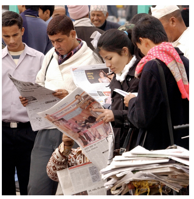
People read newspapers reporting on Nepalese government and Maoist rebels signing peace agreement in Kathmandu, 22 November 2006.

The armed conflict waxed and waned from 1996 to 2001, when a short-lived peace agreement was signed. Throughout the conflict the government was able to retain control in the cities, while the CPN-M had more support in the countryside. A series of peace agreements and discussions were signed and then failed throughout the early 2000s, until the Nepali king Gyanendra asserted complete control over the government in 2005. His attempt to reassert complete monarchical rule was intended to centralize government authority in the face of the rebellion, but it triggered large-scale pro-democracy movements that eventually led to three-way discussions between the king, the Nepali pro-democracy Seven-Party