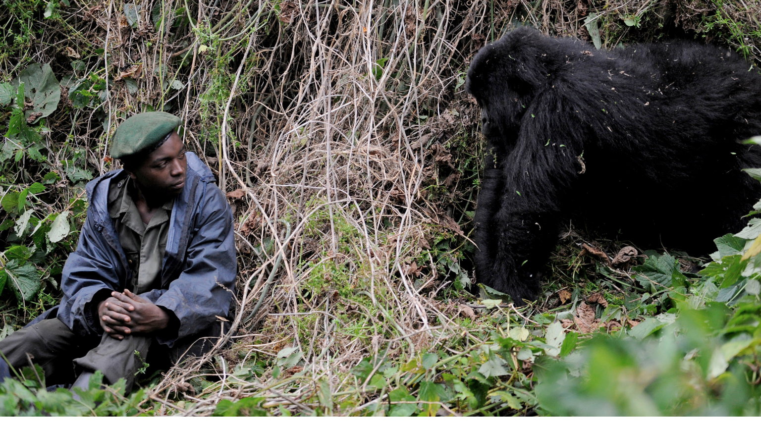
An adult male gorilla looks at a park ranger as a group of rangers conduct a gorilla population census, on the slopes of Mount Mikeno in the Virunga National Park on November 28, 2008.