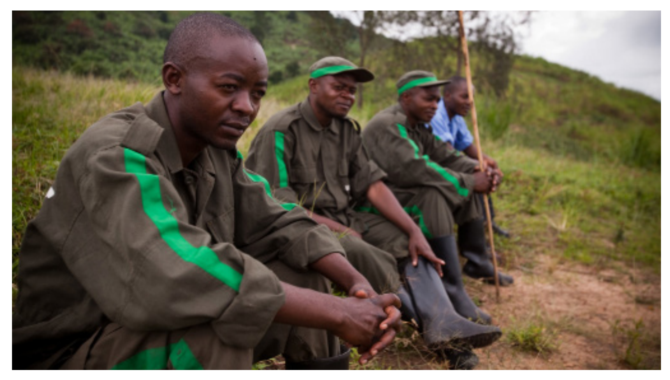
Virunga park rangers in eastern DRC.

local economy requires attracting investment and capital flows. Thus, there is a commitment by the Virunga Alliance to improve the local infrastructure and governance.