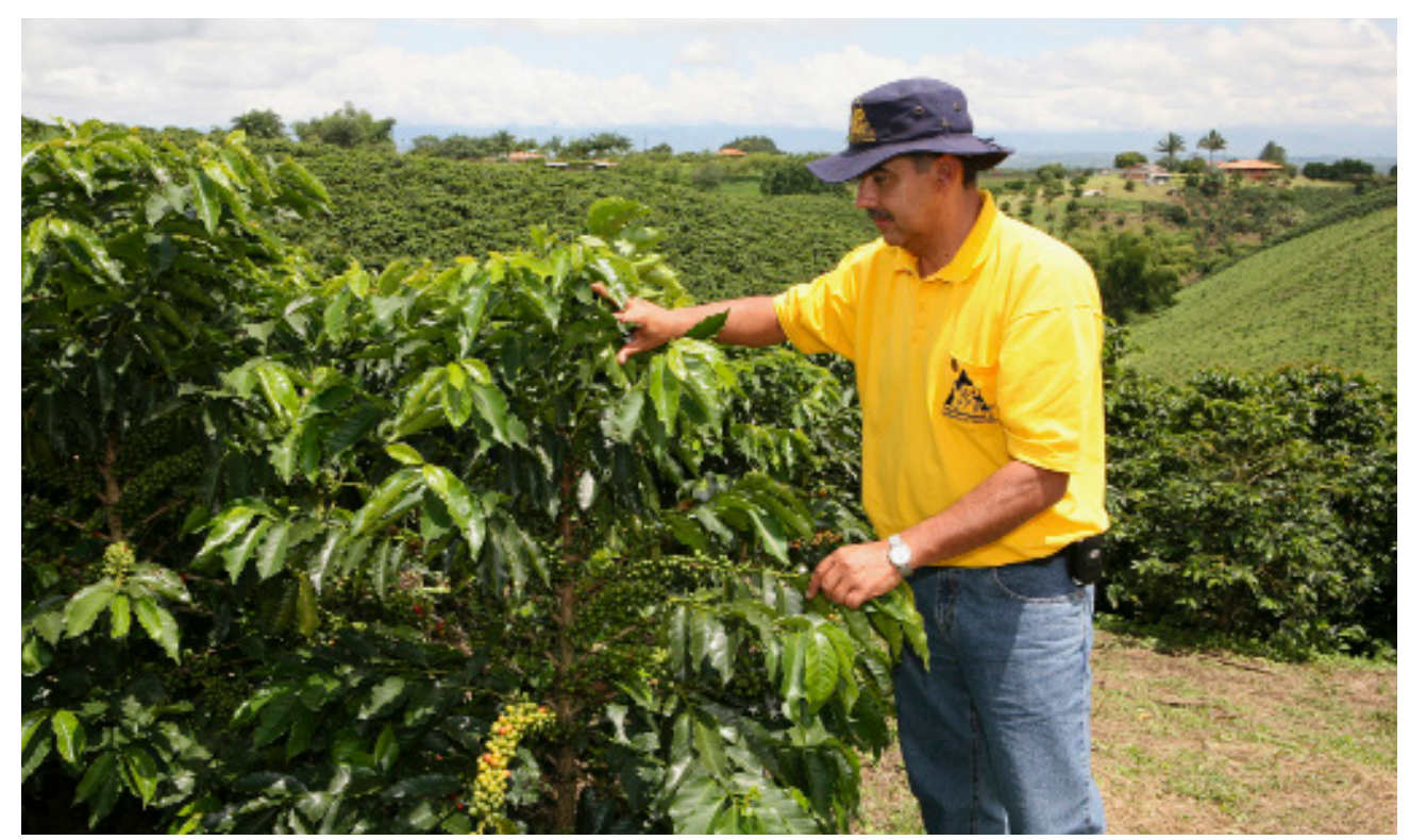
Colombian National Federation of Coffee Growers member.

organizations or associations, there are several where a specific individual's vision or decisions can be identified as key parts of the story, as in the cases of PeaceWorks and the Virunga Alliance.