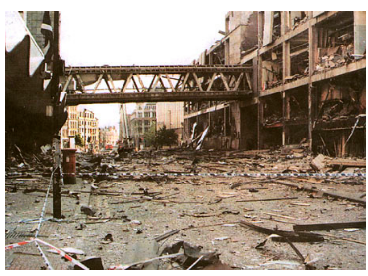
1996 PIRA bombing at a shopping center in Manchester.

Following the end of the Irish War of Independence with the Anglo-Irish Treaty of 1921, the island of Ireland formalized an existing split between southern and Northern Ireland with the creation of an independent Irish Free State (now the Republic of Ireland) in the south and a UK-governed territory in the north. Within Northern Ireland, sectarian tensions between Irish nationalists desiring alignment with the Irish state and unionists who wanted to maintain the status quo led to long-running dissent. This was exacerbated by policies around voting and representation that led to nationalists' feeling excluded from formal representation and access to economic benefits such as valuable employment. In the 1960s, tensions increased following further engagement with the Republic of Ireland and rising concerns about discrimination. Opposing marches in 1968 and 1969 ended violently, with both sectarian