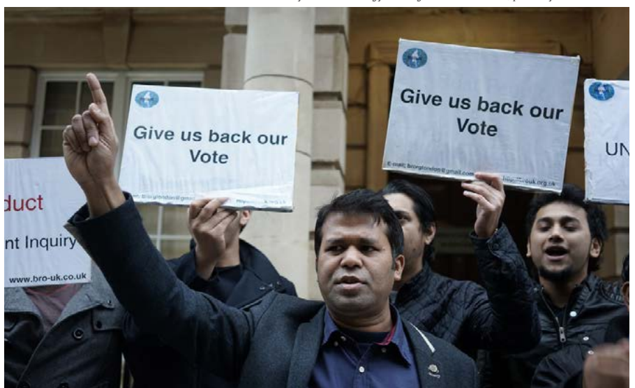
Amnesty UK and Rohingya during Burmese Election

Democracies use less coup-related repression, including government allegations of foiled coups and arrests of political rivals and military elites. All else being equal democratic governments are less than 50 percent as likely as nondemocratic governments to use these coup-proofing tactics.