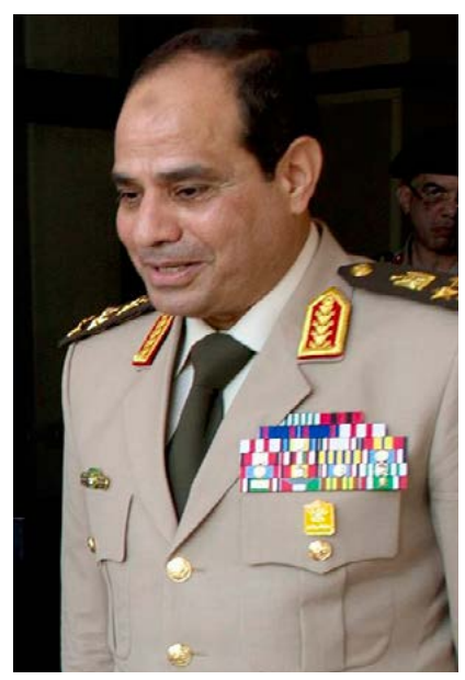
General Al Sisi

In the first decade after the Cold War, the global frequency of coups d'état fell by nearly 50 percent. This sharp decline inspired hope for a more democratic future with fewer military governments. But following this initial decline, the drop in coup activity stalled, as did the progress of global democratization. The share of the world's countries classified as "free" by the think tank Freedom House has been near 45 percent since the turn of the century and there have been more successful coups over the last decade (seventeen from 2005 to 2014) than there were in the decade before that (fifteen from