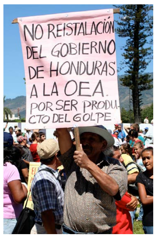
Protesting reincorporation to the Organization of American States (OAS) after a coup in Honduras; photoy by Laura on Flickr

These predictions are supported with a global statistical analysis of coup activity from 1945 to 2011. The analysis finds democracies to be approximately 50 percent less likely to accuse elites of coup plotting, but no less likely to suffer coup attempts. Though democracies and nondemocracies suffer coup attempts with similar frequencies, coups against democracies are more than twice as likely to be successful. Since World War II more than half of the coups attempted against democracies succeeded, but two out of three of those attempted against nondemocracies failed.