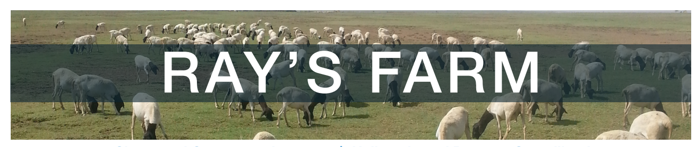
Sheep and Goat Fattening Farm | Halimaale and Borama, Somaliland